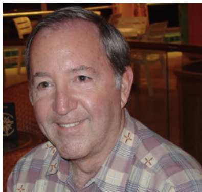
For the Good of the Order.

Spring is on the cusp in Spokane and we're ready! We are working with the Navy to schedule some events for "Salute to the Military" week which coincides with many Lilac Festival events. We plan to have a ranking Naval officer as a guest speaker at the Post on May 21. Also on that date, we will be hosting a breakfast for military personnel and their families along with anyone from the VFW that would like to attend. That same evening we march in the torchlight parade so come on down, learn something and show our colors.