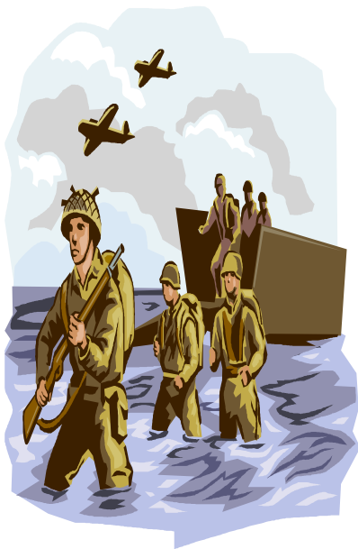
D-DAY JUNE 6TH